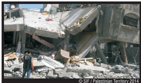
© SIF / Palestinian Territory 2014